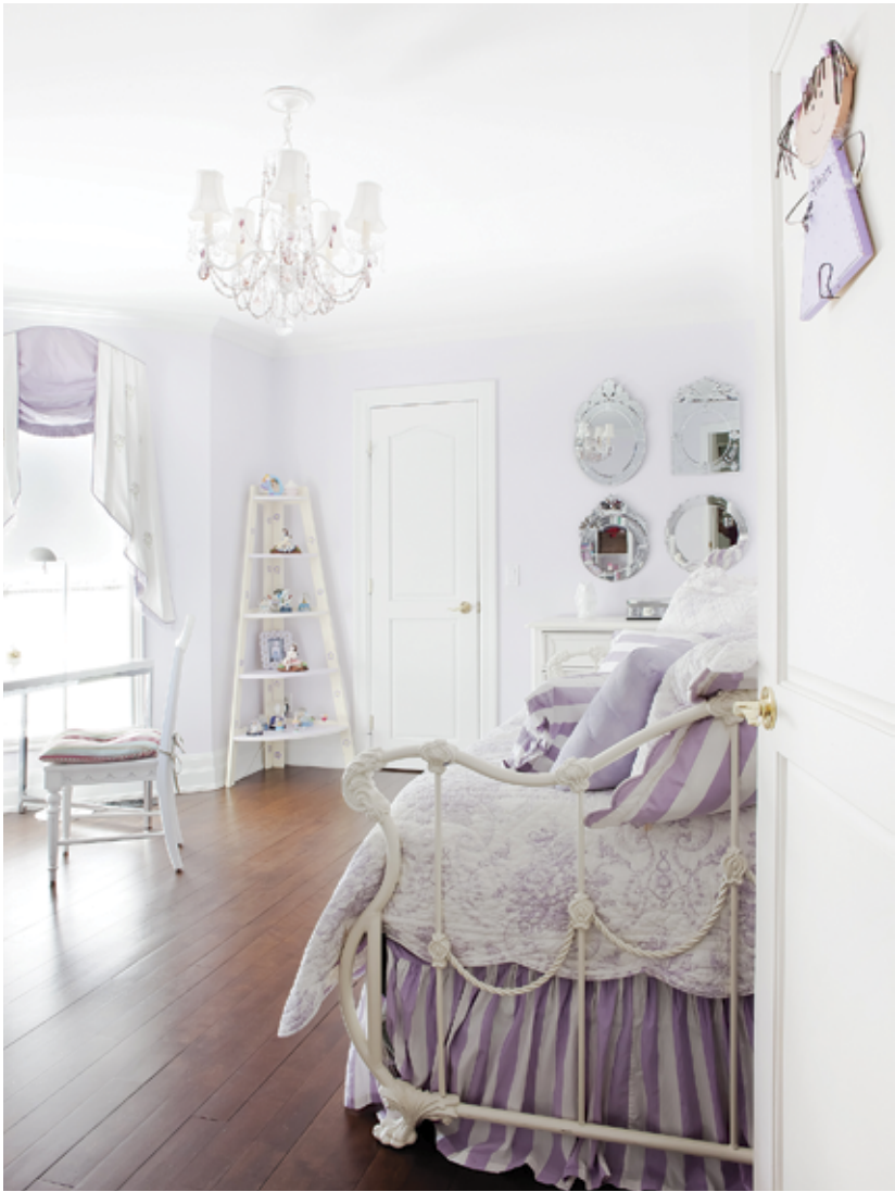
Upstairs, the bedrooms and master bath offer sanctuary and repose after a long day. (Opposite) The master bed headboard is custom made by Evolution Design, as are the decorative pillows. The bedding hails from Yves Delorme and the carpet is from Indiport.